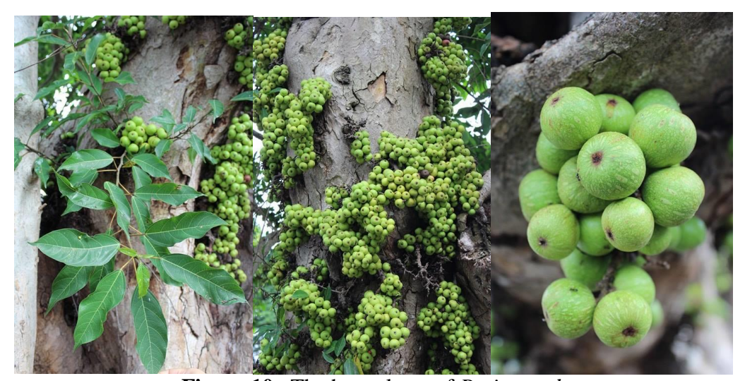
Figure 10. The host plants of Perina nuda