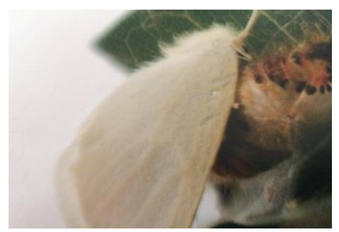
Figure 7. The female adult of Banyan tussock moth

Description of females: pale yellow head and labial palp, bipectinate antenna, body length 11.0-12.50 mm, abdomen covered with white hairs (Fig. 7), 2-3 smaller frenulums on the hindwing (Fig 8.).