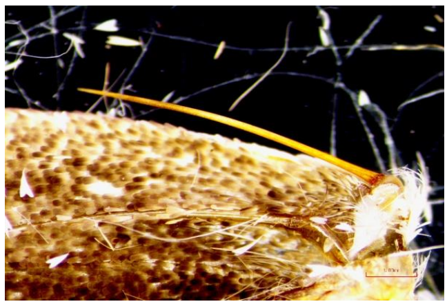
Figure 6. A frenulum of the male