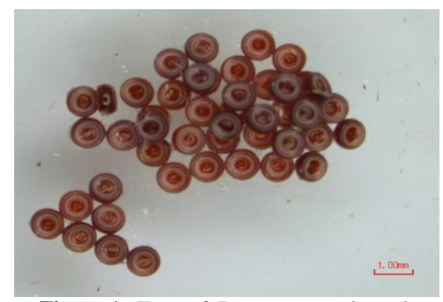
Figure 1. Eggs of Banyan tussock moth