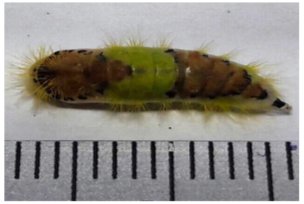
Figure 3. A hairy pupa of Banyan tussock moth