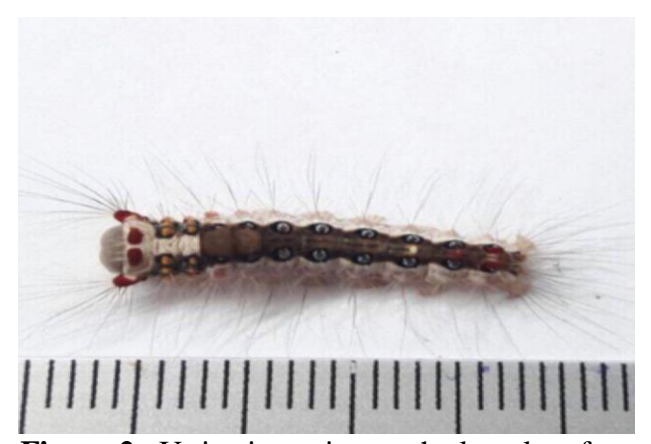
Figure 2. Urticating spine on the larval surface