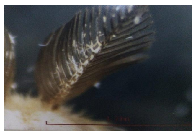
Figure 4 . A bipectinate ante