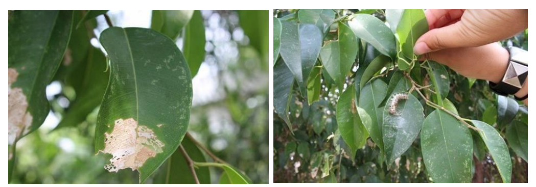
Figure 9. The insect infestation of Banyan tussock moth