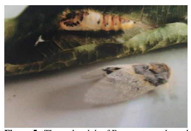
Figure 5. The male adult of Banyan tussock moth